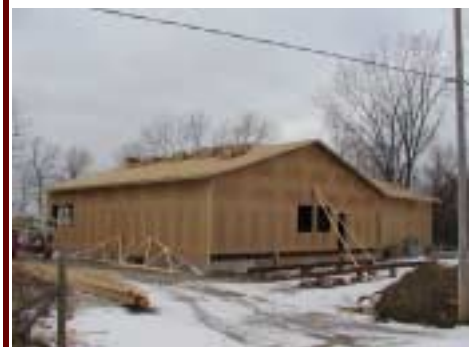
J.F. Walleyes continues the rebuilding process and hopes to be open by the start of the season.

If enough people express the desire to participate, we will finalize plans and publish details and a signup form in the May newsletter.